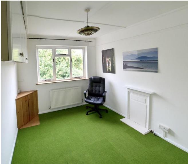
LEFT: The room was repainted during August 2018 so is fresh and bright.